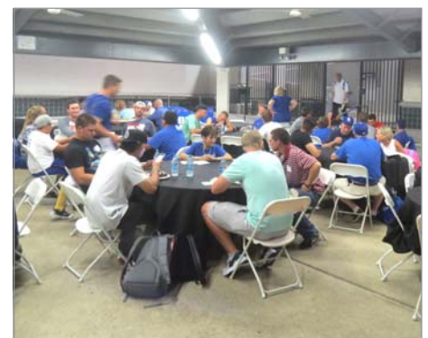
Quakes Post Game Players & Members