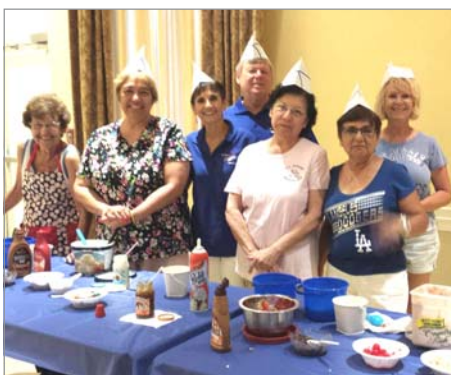
Ice Cream Social - Super Scoopers